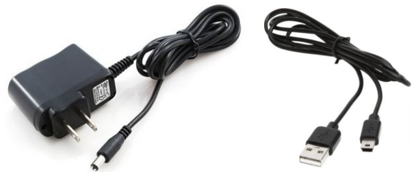
5Vdc Power Supply

Ports: 1 upstream port and 4 downstream ports Compliance: FCC regulations for home or office use CE emissions Power Bus-Power: 5V 500mA External Power Supply: 5V, 4A Adapter: Input: 100~240v 50Hz-60Hz Output: 5V 4A Dimensions: 65.34mm (L) * 40.08mm(W) * 18.03mm (L) Storage Temperature: -10~85 degrees (Celsius) Working Temperature: 0~40 degrees (Celsius)